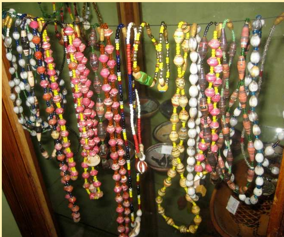
These craftworks are made out of wood, natural materials and paper, that is rolled to form paper beads

Furthermore, the participants learn how to design things for themselves, while some members use this opportunity to meet new people and share their experiences while sitting together.