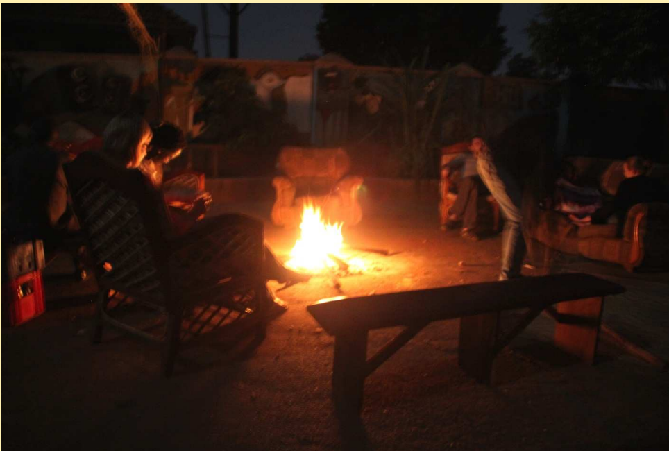
Top: Sitting around the fire, making bread on sticks and potatoes

Since the day is celebrated all over the world, we also organized a party for the girls at Rainbow. During the festivity, many activities took place such as badminton, volleyball, dancing, eating, drinking and finally sitting around the fire while enjoying music. This was such a success because we also support the need for improved treatment and rights for women.